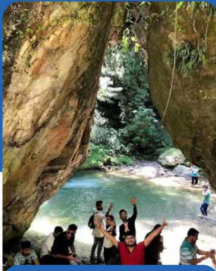
Jibhi & Tirthan Valley