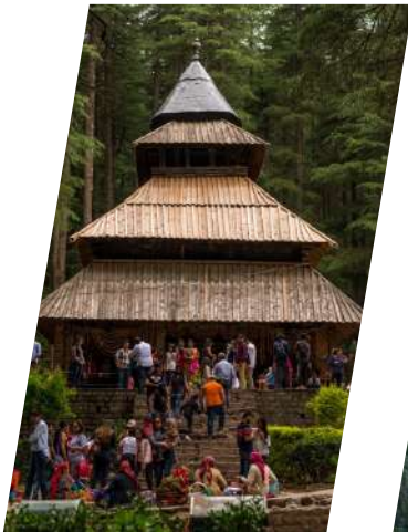
Hadimba Devi Temple